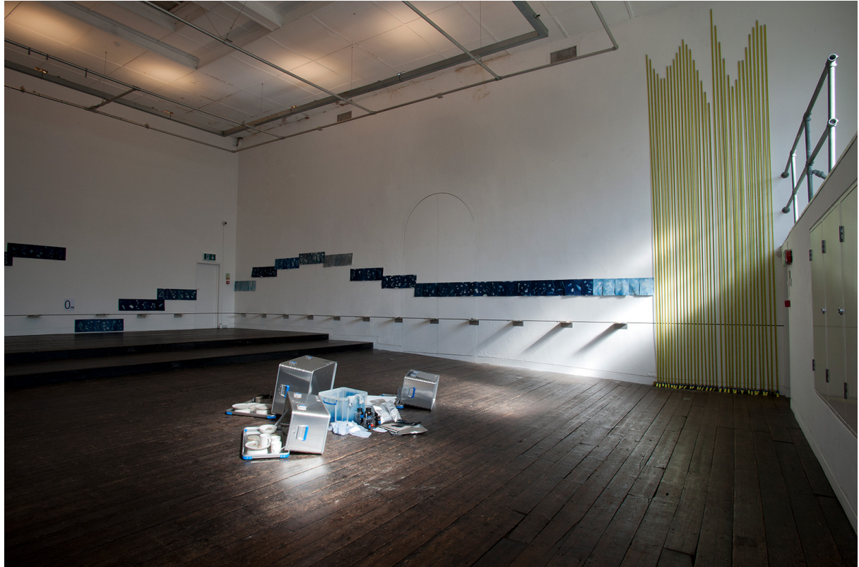
Tuula Närhinen, DEEP TIME DEPOSITS (2020), exhibition view, Beaconsfield Gallery Vauxhall, photo by Jill Mead.

https://beaconsfield.ltd.uk/projects/beacon_transitions/