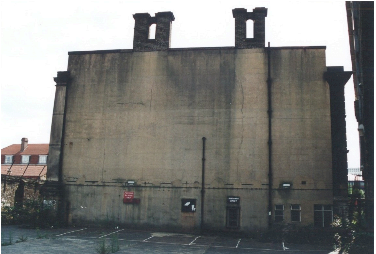
North facing outer wall Girls wing, Lambeth Ragged School, prior to refurbishment by Beaconsfield in 1995 showing Fire Brigade parking spaces..