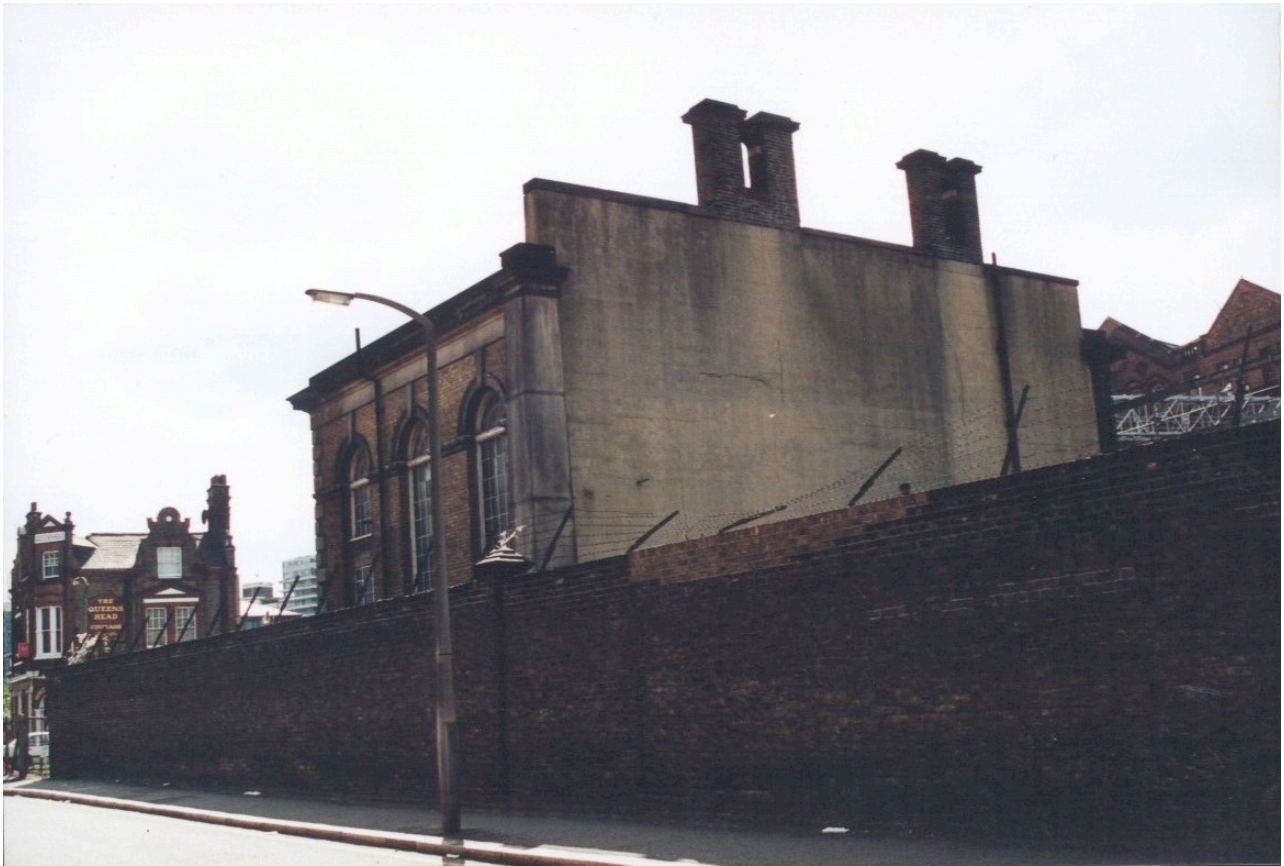
East facing outer wall and South facing outer wall Girls wing, Lambeth Ragged School, prior to refurbishment by Beaconsfield in 1995 (from a North Eastern perspective), showing The Queens Head, a contemporaneous Victorian pub of appropriate scale to the Victorian building. The proposed 11 storey tower block would sever the relationship between the two buildings and take light from both.