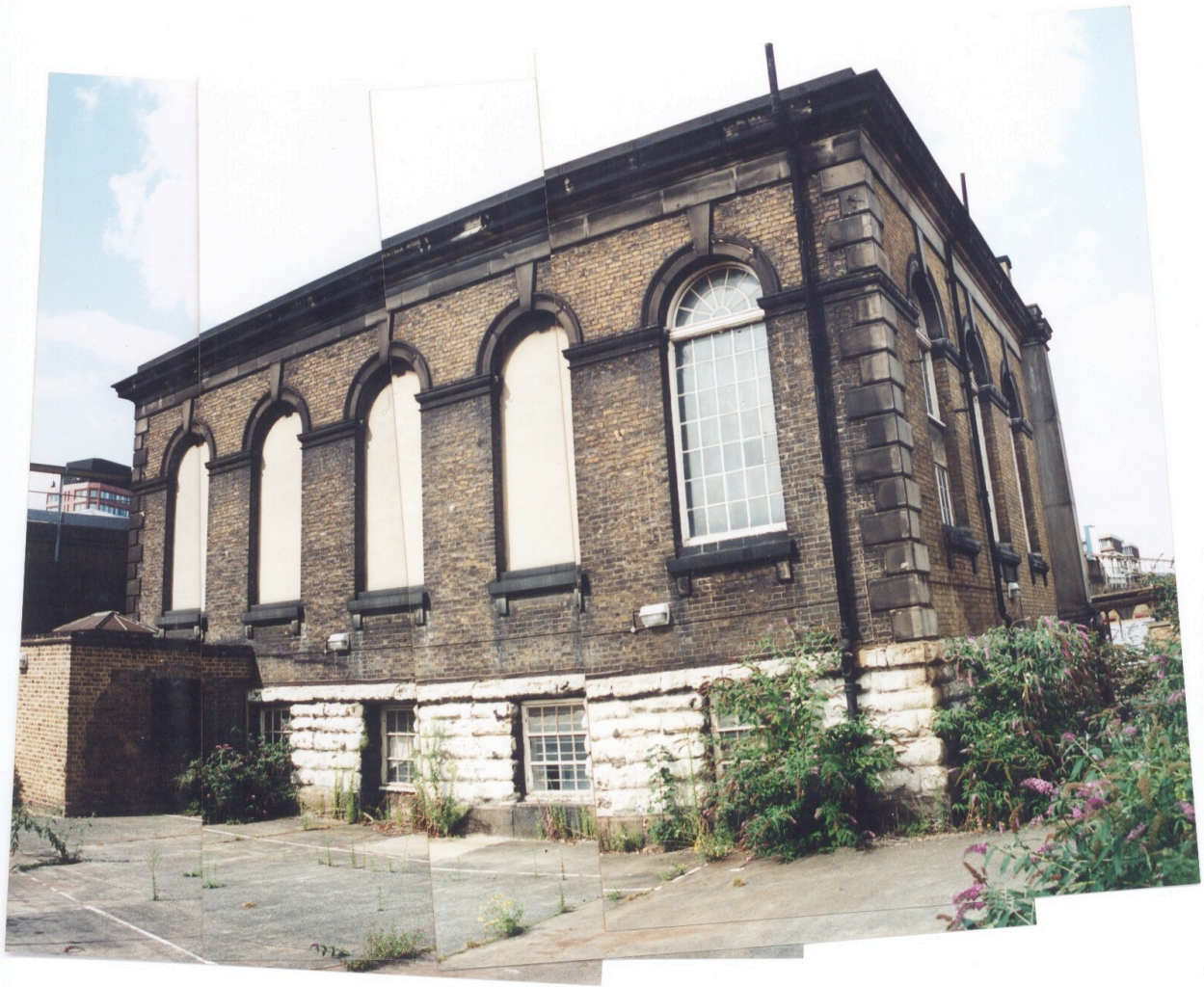
South facing outer wall Girls wing, Lambeth Ragged School, prior to refurbishment by Beaconsfield in 1995.