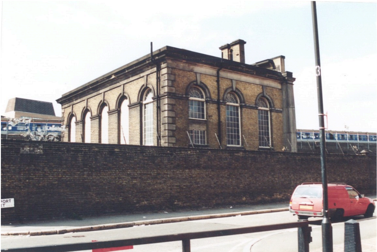
East and South facing outer walls Girls Wing, Lambeth Ragged School, 1995, prior to refurbishment by Beaconsfield (from a South Eastern perspective) showing windows into what is now Beaconsfield's Upper Gallery.