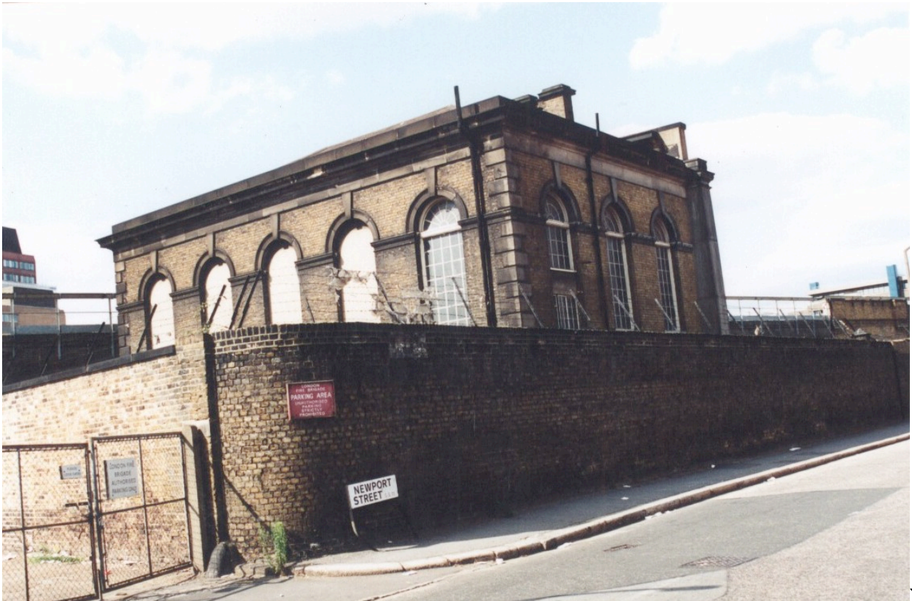
South and East facing outer walls Girls wing, Lambeth Ragged School, prior to refurbishment by Beaconsfield in 1995 (from a South Eastern perspective) showing gate into derelict corner plot due for redevelopment.