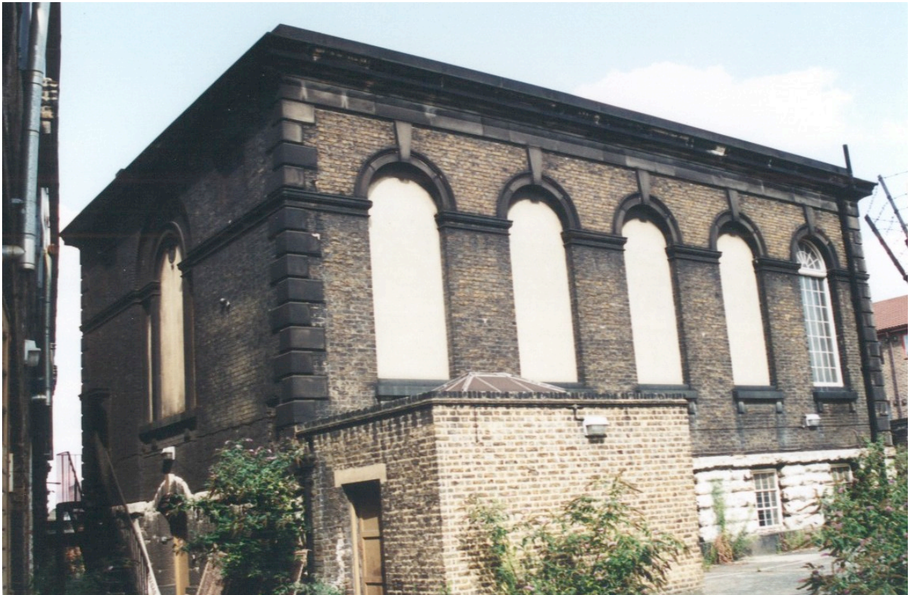
Southwest facing outer wall Girls wing, Lambeth Ragged School, prior to refurbishment by Beaconsfield in 1995 (from an Eastern perspective).