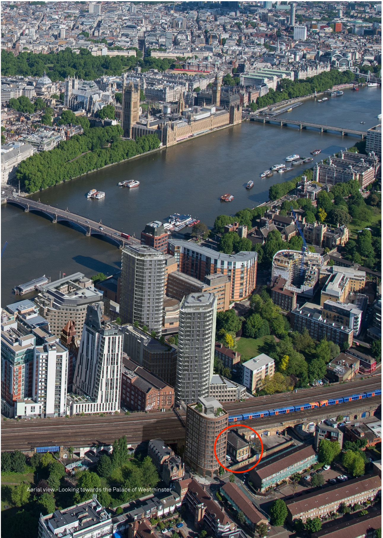
Aerial view - Looking towards the Palace of Westminster