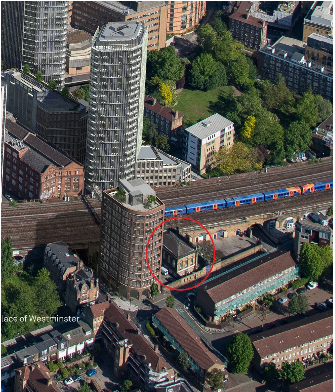
Aerial view proposed, close-up. Beaconsfield with red ring.