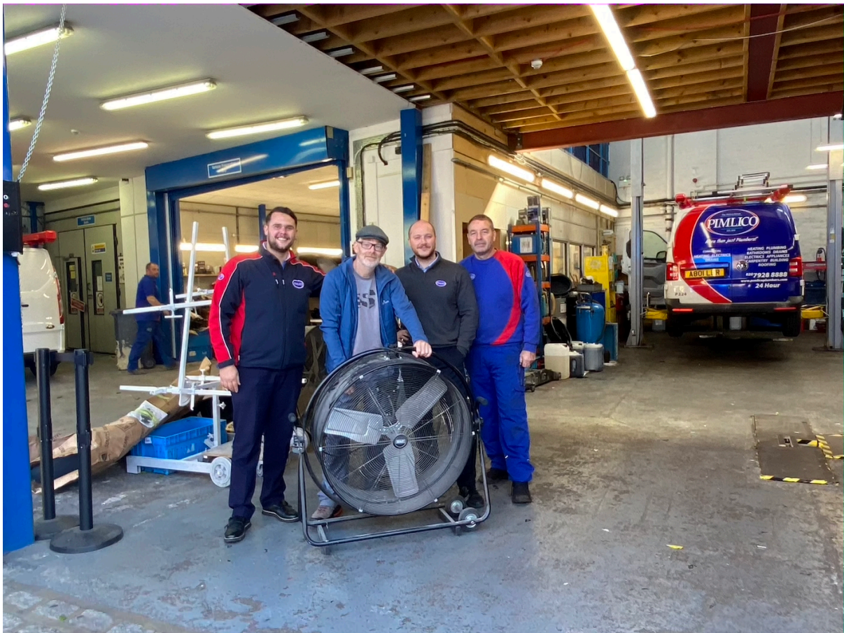
Big thanks to our neighbours Pimlico Plumbers for production assistance!