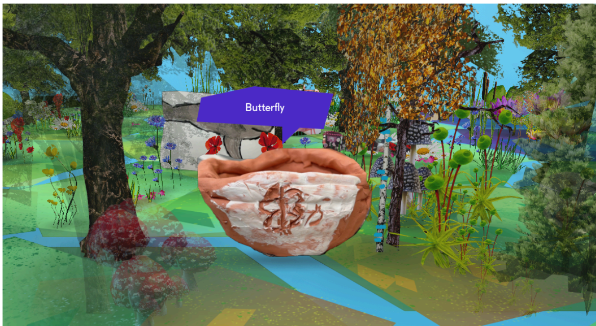
The clay pots were brought together in a collective digital work of art that imagined a better future for the wildlife on our doorstep, launched online as part of The Wild Escape in museums on Earth Day 2023.