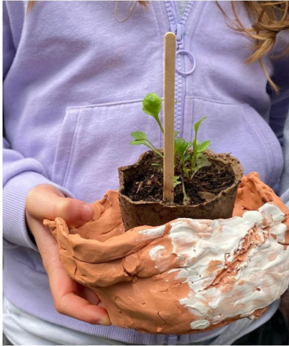
Students collect their fired terracotta plant pots from Beaconsfield on Saturdays, and a plant to grow at home.