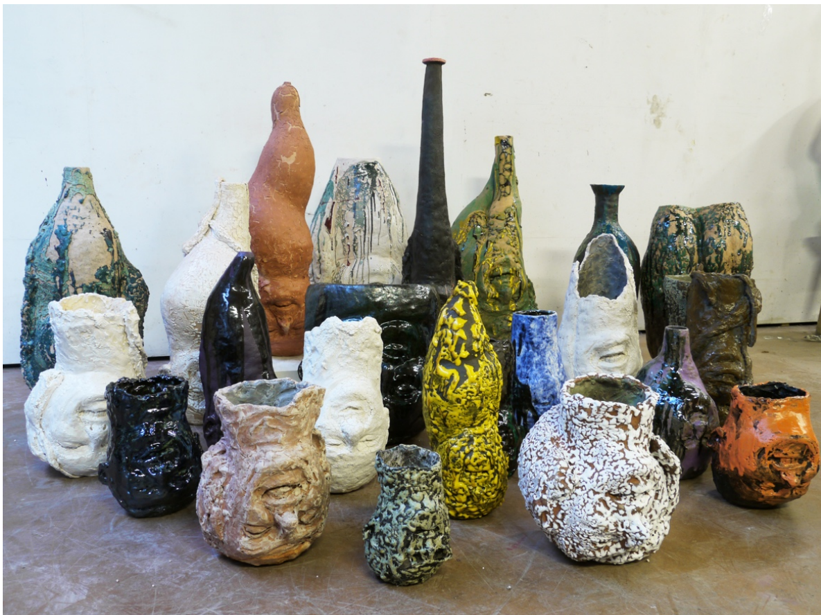
Simon Bedwell, The Cabinet , 2017. Glazed ceramic.

For further information please contact Naomi Siderfin: naomi@beaconsfield.ltd.uk